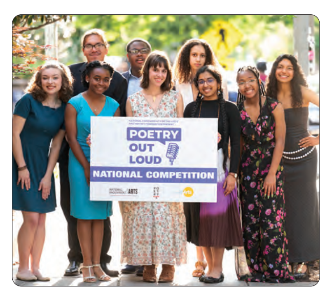
2023 Poetry Out Loud National Finalists