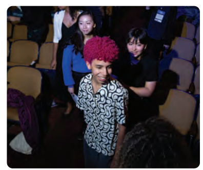
State and jurisdictional champions from across the country compete in DC over two days.